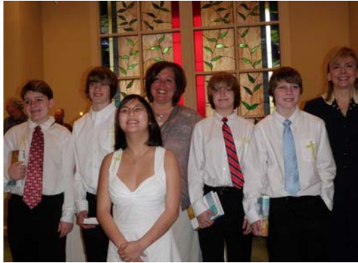
2010 Confirmation Class

Ange's photo will be in the next Love Notes.