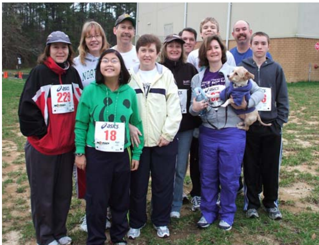
PSFUMC Participants at the Spring Run!

Hickory Flat Church Job Ministry. Men and women who are unemployed or in the wrong job or career are invited to the Hickory Flat United Methodist Job Ministry meeting held the second Thursday of each month. The program is free. For more info call 770.345.5969, ext 210.