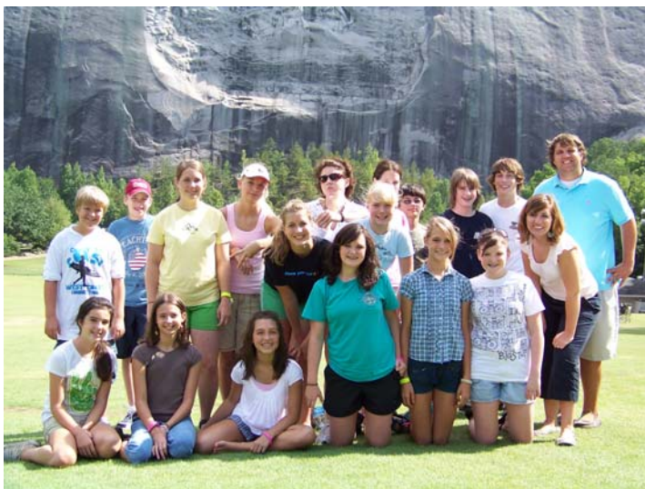
Summer Sunday at Stone Mountain

The Source: is the Sunday night filled with games, worship, and scripture. Our goal is ignite a passion for Christ so that we can share our light with those around us.