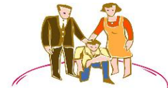
Leadership Commissioning Service