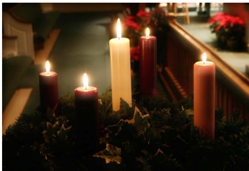
Advent Wreath Aglow with Jesus' Light