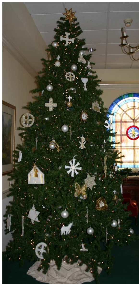
United Methodist Women's Crismon Tree