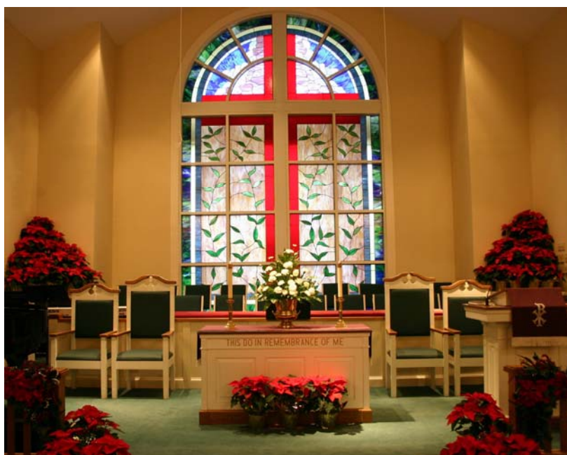
The Sanctuary Decorated with Poinsettias Dedicated in Honor and in Memory of our Loved Ones